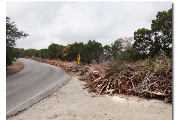
Many property owners utilized the free brush collection project to remove dangerous dead wood and brush from their properties. Minimizing fuel loads on densely vegetated tracts will help reduce the risk of wildfire throughout the city.

Once the final costs of the dead brush collection project are known, the City Council will consider other initiatives to improve fire safety, including the possible installation